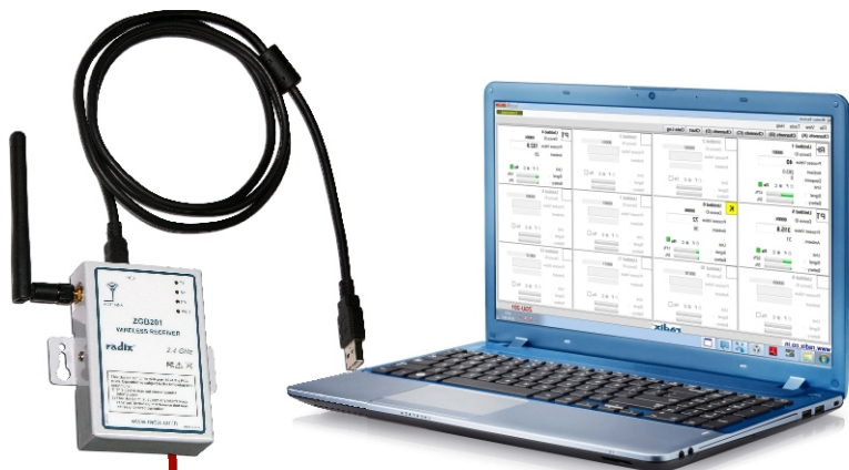
ZGB201 USB powered receiver which receive data from transmitter

ZGU201 utility for display transmitter data & to process same for data logging or chart display